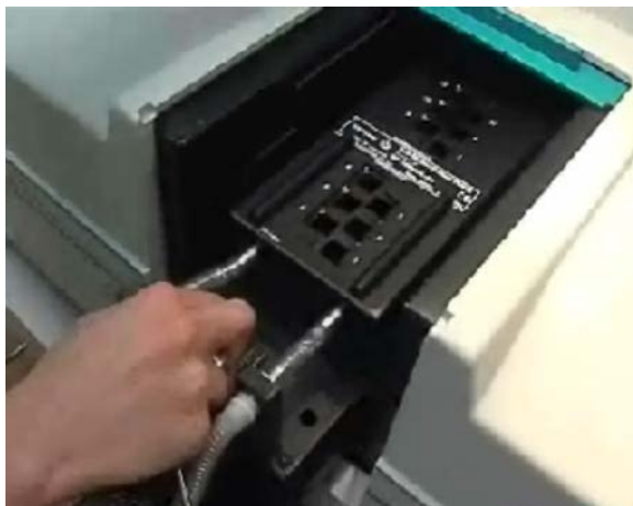
Figure 4. Sliding the top half of the accessory forward