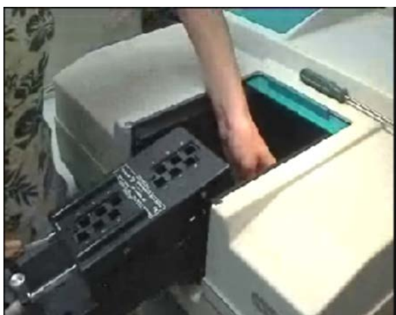
Figure 1. Resting the Multicell Holder accessory on the edge of the instrument