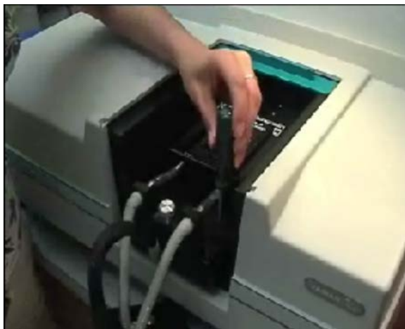
Figure 3. Tightening the front holding screw