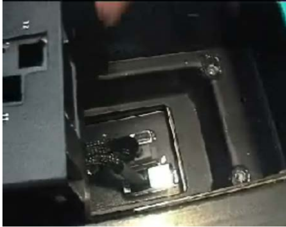
Figure 2. Connecting the two plugs on the accessory to the two sockets located in the base of the instrument