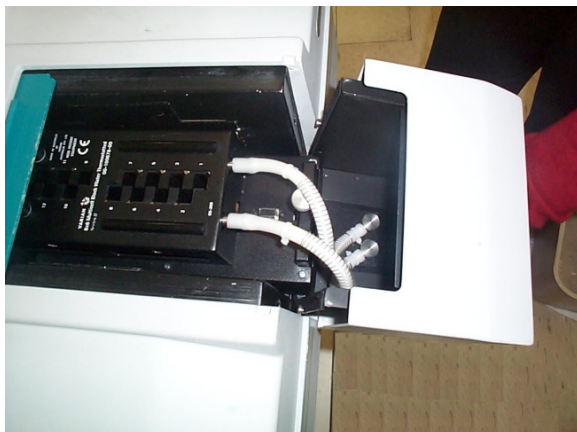
Figure 6. Attaching the Extended Sample Compartment to the instrument